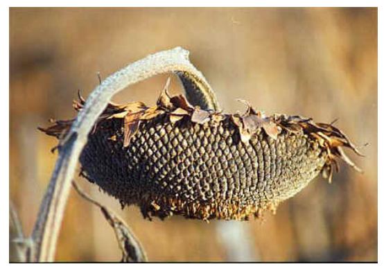
Ripe seeds still on the sunflower