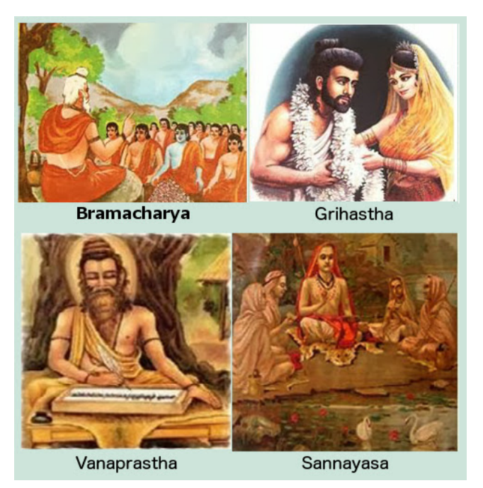
The Four Ashrams