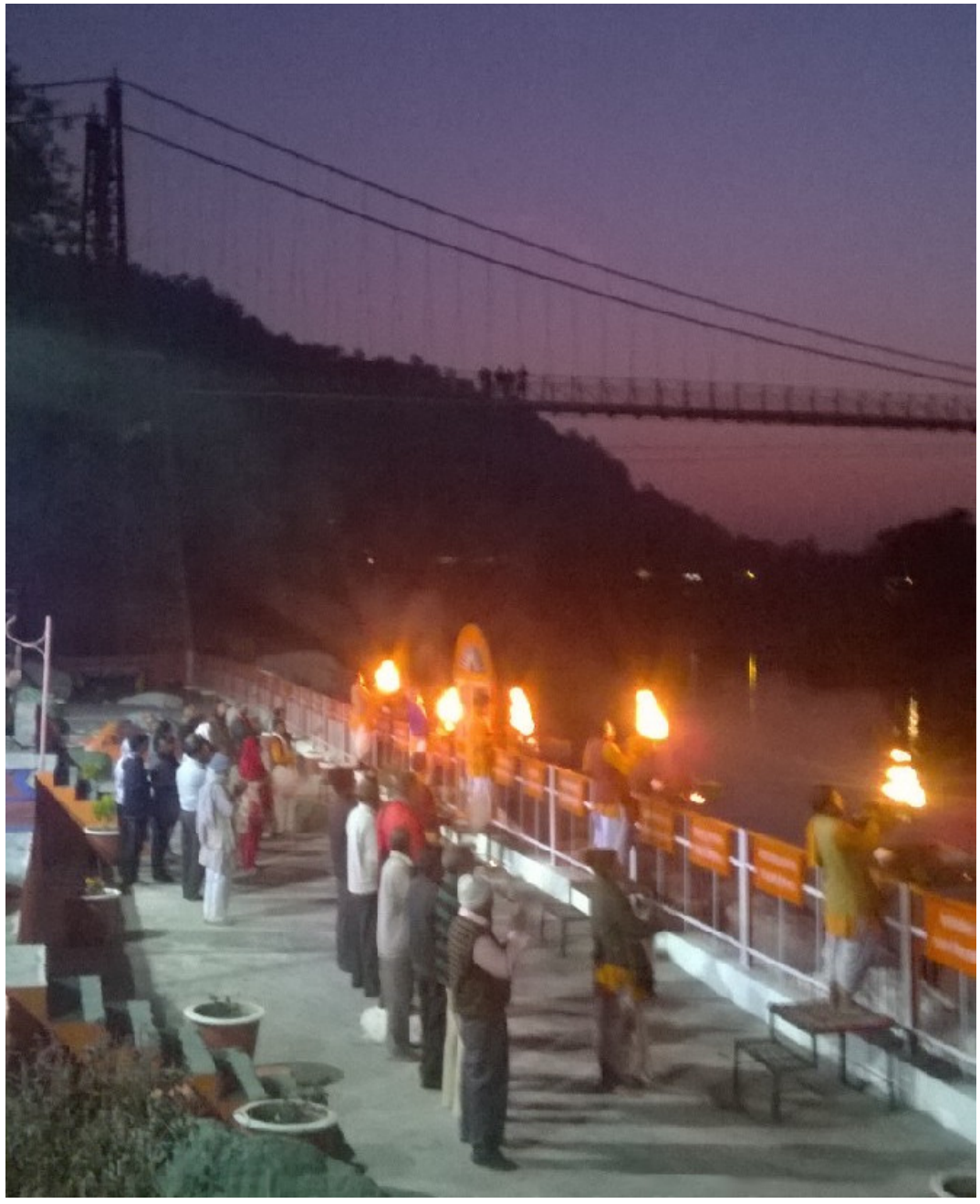
Ganga Arati is held at KMT each evening.