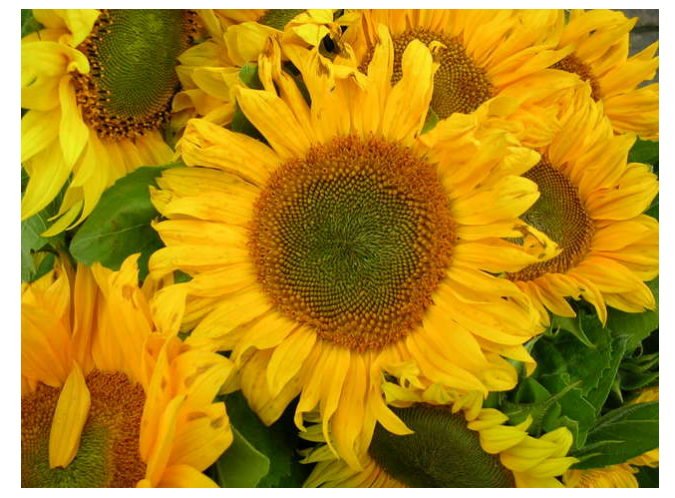
Sunflowers before the seeds have ripened

The fresh seed exbibits a light grey color in the inner seed. If the color is dark or brownish, the seed is probably old and rancid and should be avoided.