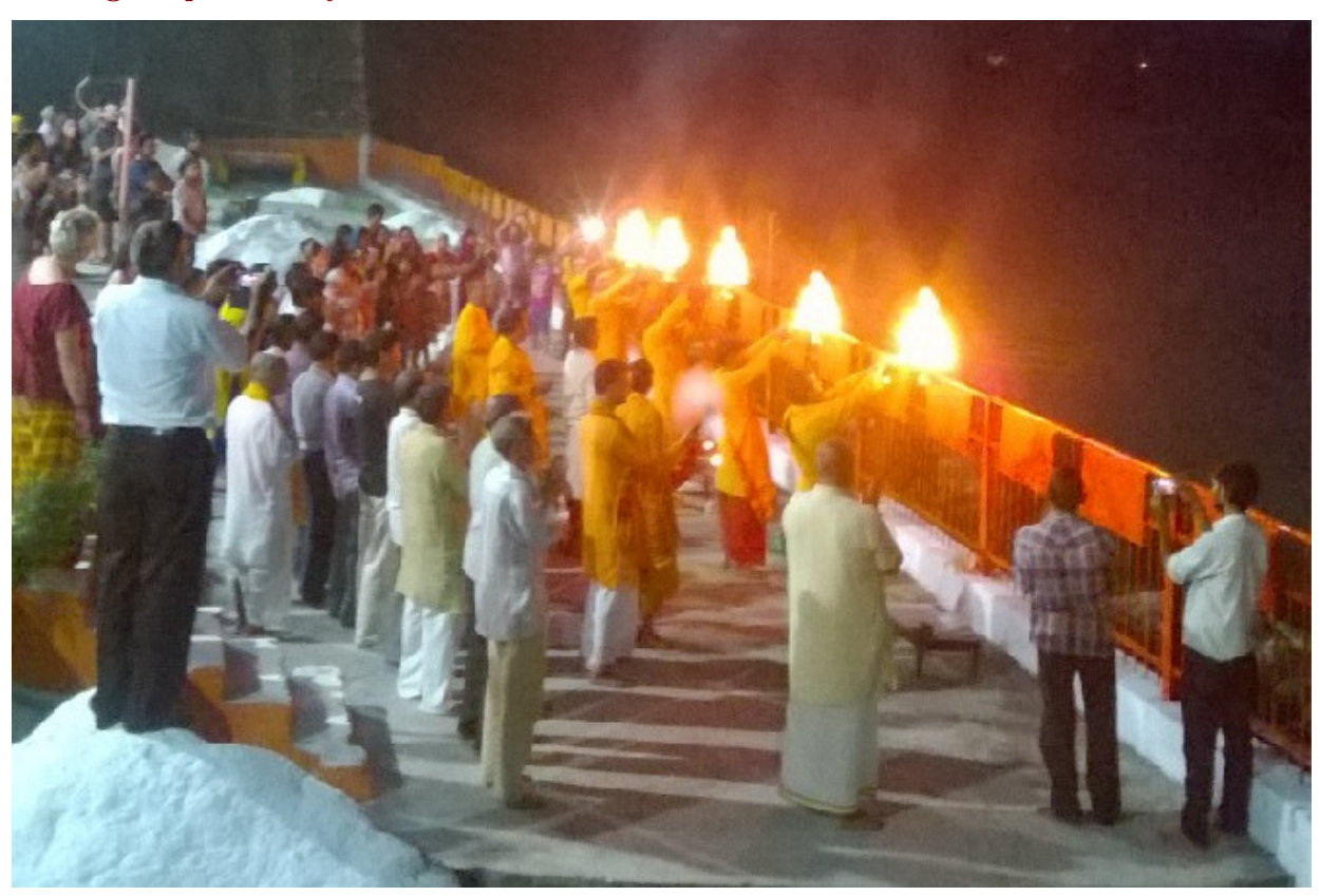
Evening Ganga Aaratee at Kailashanand Mission Trust