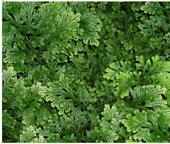
Resurrected Sanjivani Booti

looking plant. Finally, in one of his returns to the United States, when he picked up where he left off in the Nature Cure course, he said, "Well, I know this plant has remained here for several years, but I will prove a point about how powerful this herb is." So he put it in a glass of water that night, after the course. Right while were were watching he got a glass of water and put it in there, upright. He said, "You will see what I am trying to explain to you, next class."