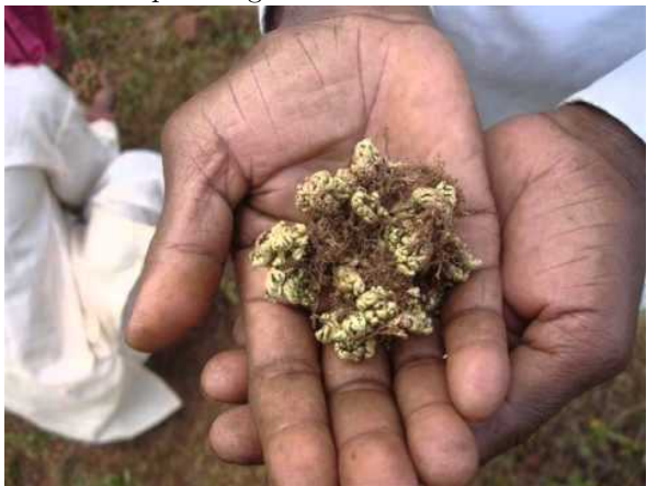
Dried Sanjivani Booti

thousand feet. If you look around at the tops of the hills they are either rounded or pointed like a typical mountain. Well, Manikoot Mountain on one side looks a little bit normal, but on the other side looks like somebody sawed off the top of it like a crew cut. Hanuman took the whole top of the mountain back to the mainland side of the Ganges, where Rama and Laxman were. There Laxman lay dying of a mortal wound from Indrajit the demon. Susena knew which one of the herbs was the Sanjivani Booti and used it to save Laxman's life when all other hope had gone.